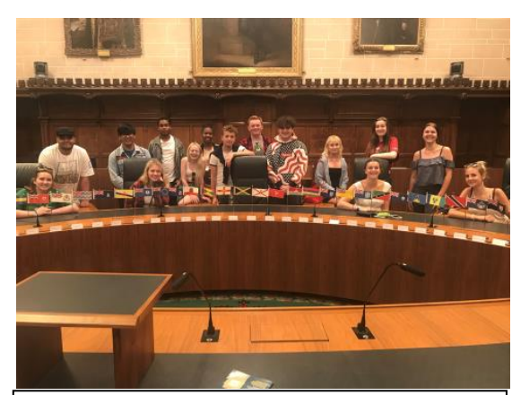
Students inside the Supreme Court in London

trip, but we set out below 3 essential steps that you should take in order to prepare sensibly for the course starting in September 2020.